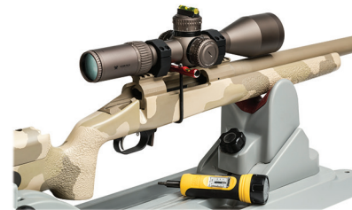
Using bubble levels to square the riflescope to the base.